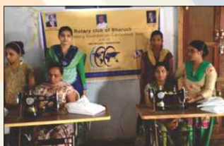
Women Empowerment Project