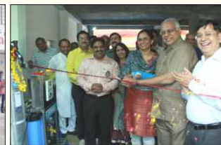
Reverse Osmosis Plant Sustainable Water & Sanitation Project