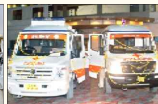
Critical Care Ambulance