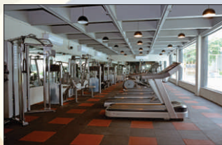
M. I. Patel Rotary Youth Centre