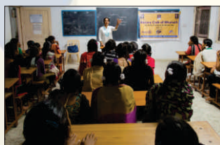
"Hum Honge Kamyab"