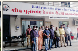
Shroff Poonamchand Devchand Rotary Diagnostic Centre