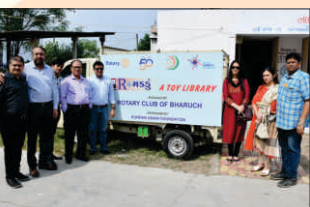
"Romakadu" A Toy Library