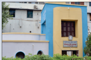
Pay & Use Toilet